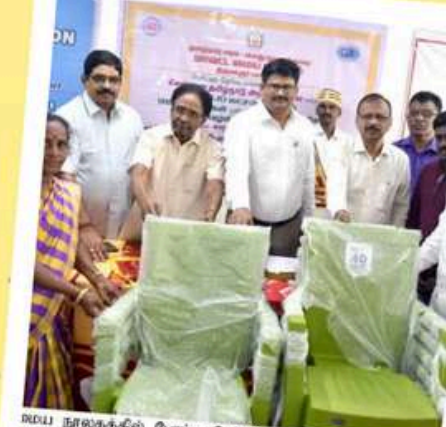
மைய நூலகத்தில் போட்டி தேர்வு நபாராஜம் மாணவர்களுக்கு ரூ.6.10 லட்சம் மதிப்பில் 911 புத்தகங்கள் மற்றும் 100