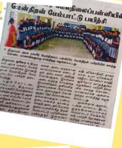
மேன்திறன் மேம்பாட்டு பயிற்சி