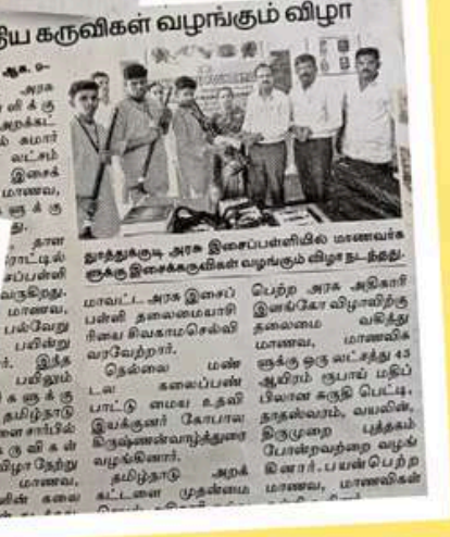
வாத்திய கருவிகள் வழங்கும் விழா