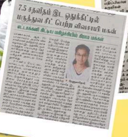
7.5 சதவீதம் இட ஒதுக்கீட்டில் மருத்துவ சீட் பெற்ற விவசாயி மகள்