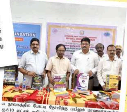
ய நூலகத்தில் போட்டி தேர்வு நபாராஜம் மாணவர்களுக்கு ரூ.6.10 லட்சம் மதிப்பில் 911 புத்தகங்கள் மற்றும் 100 நூ