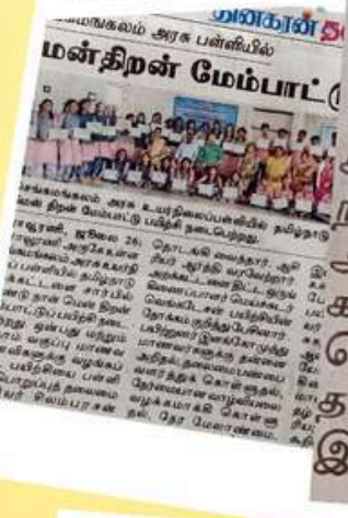
மன்திறன் மேம்பாட்டு பயிற்சி